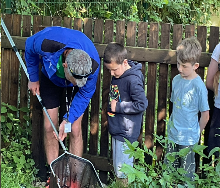
In Wild Tribe the children did pond dipping and looked for wild life within the school grounds.