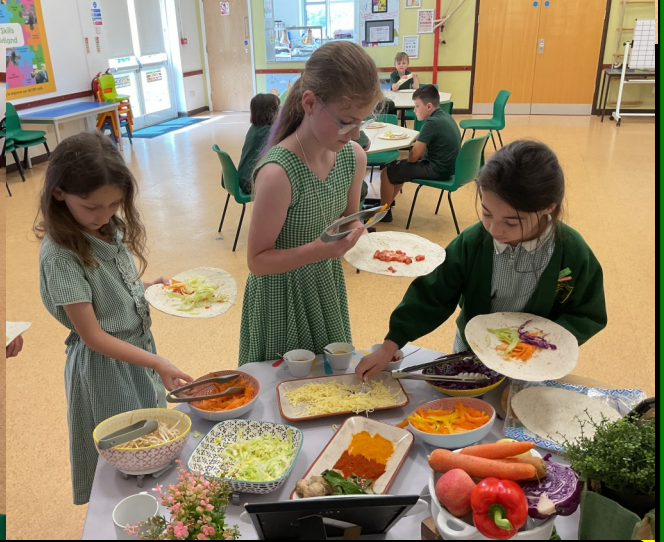
Children in Years 2-6 made wraps as part of a visit from the catering company to promote healthy eating.