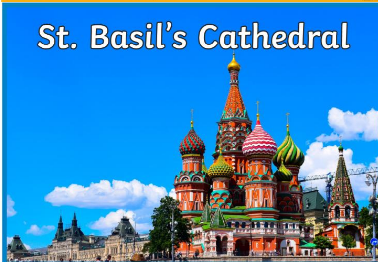
St. Basil's Cathedral