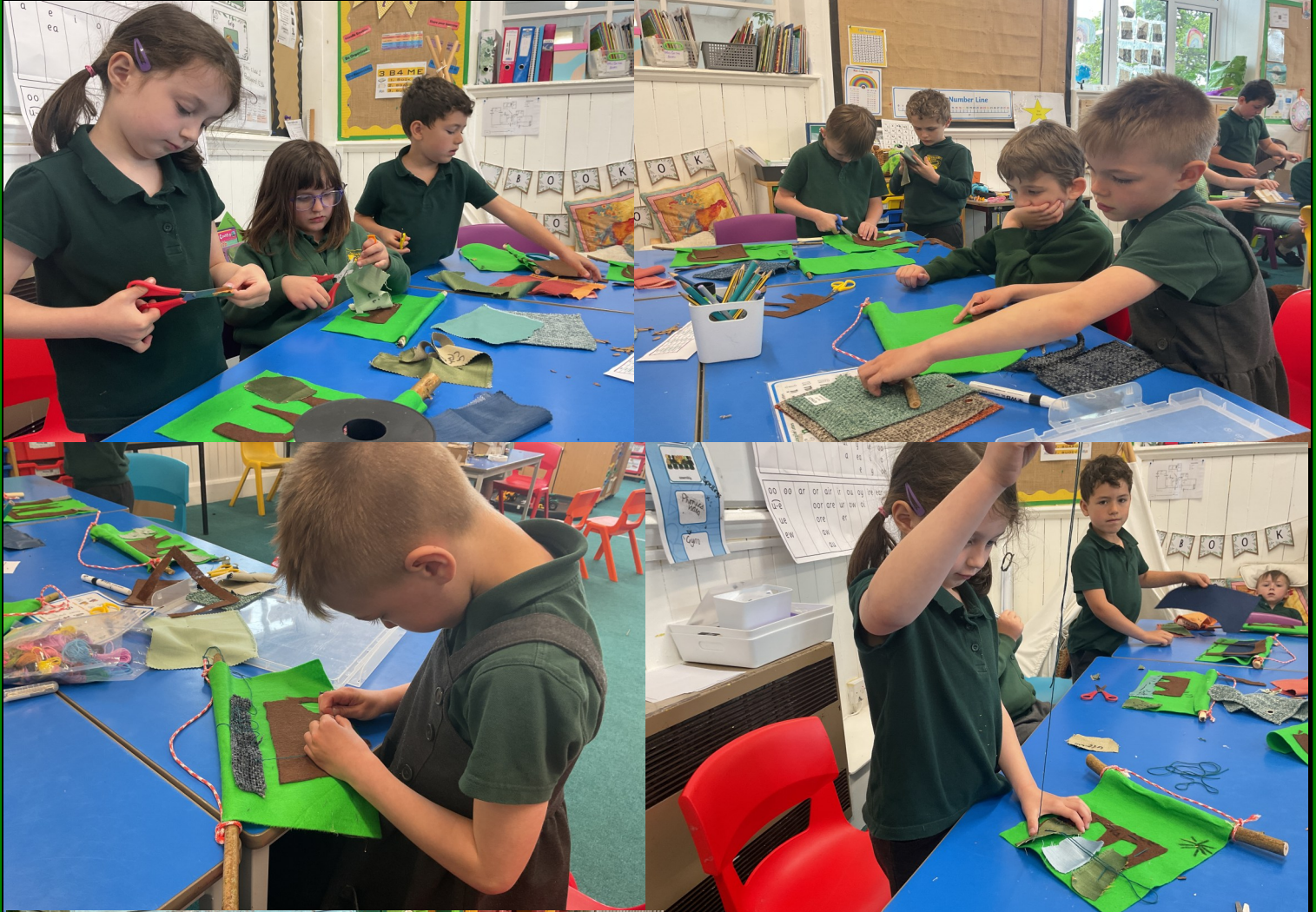
The children in Class 1 continued their learning about Lovely Liskeard and created wall hangings of the viaduct as part of the DT work.