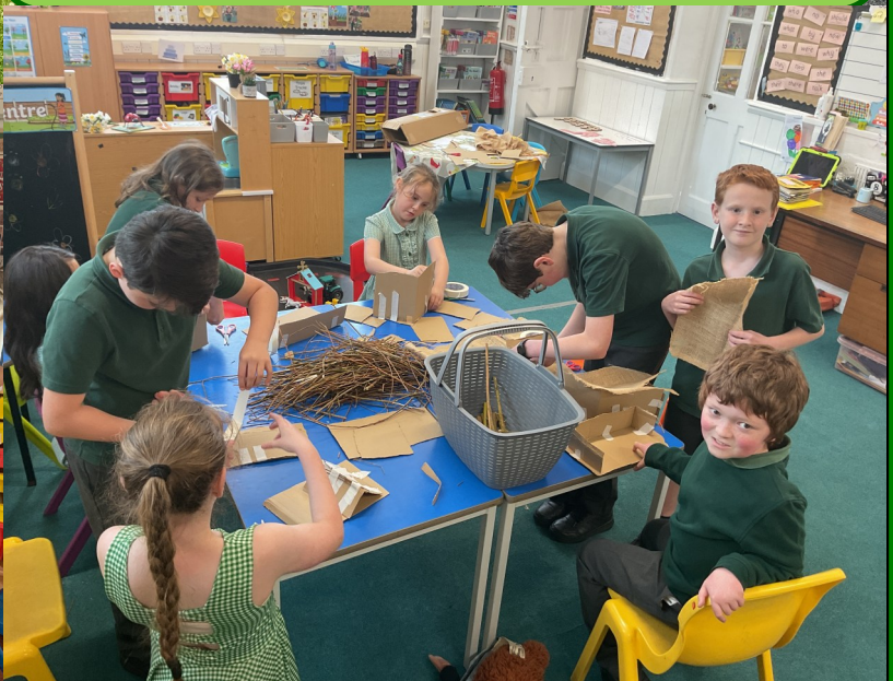
The children in Class 2 continued their work on the Anglo-Saxons building houses as part of their DT work. They also learnt a poem as part of Poem of the Week.