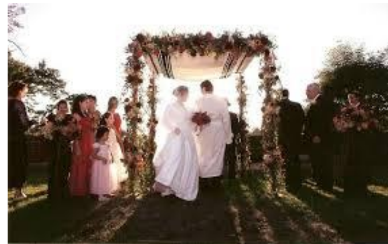
A Jewish wedding under a special canopy called a chupa