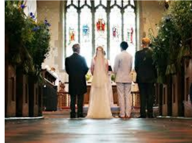
A Christian wedding in a church