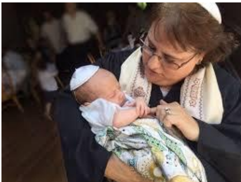
brit bat – a Jewish naming ceremony for girls brit ben – a Jewish naming ceremony for boys