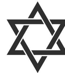
Star of David