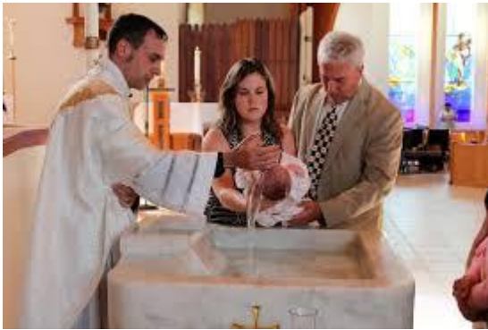
Baptism – a Christian naming ceremony